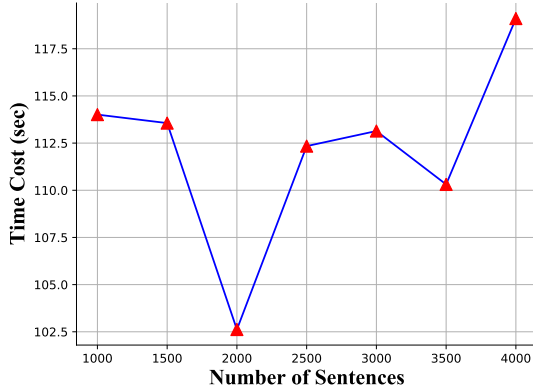
Figure 1: Results on Student-6-1-512 model. The time cost is measured on an Intel Xeon Gold 6240 CPU with 100,000 lines of raw English sentences with an averaged length of 18 words.

significantly accelerates the inference compared to a fixed batch size when the sequence length is short.