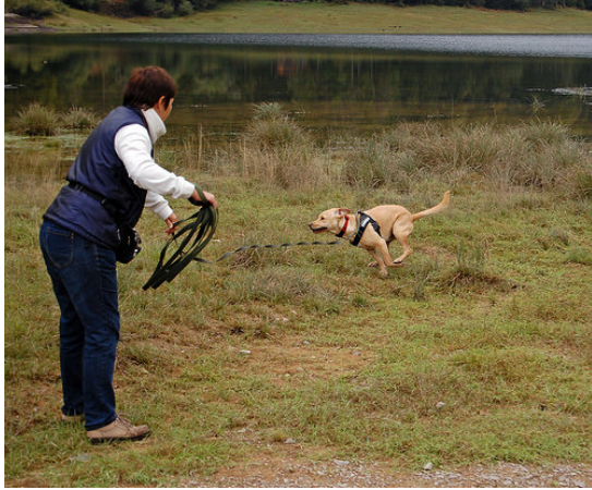
Figure 2: Image 117 was translated correctly as feminine “eine besitzerin steht still und ihr brauner hund rennt auf sie zu.” when not using the image features, but as masculine “ein besitzer ...” when using them. The English text contains the word “her”. The person in the image has short hair and is wearing pants.

size 4096 tokens, label smoothing 0.1, Adam with initial learning rate 2 and \beta_2 0.998.